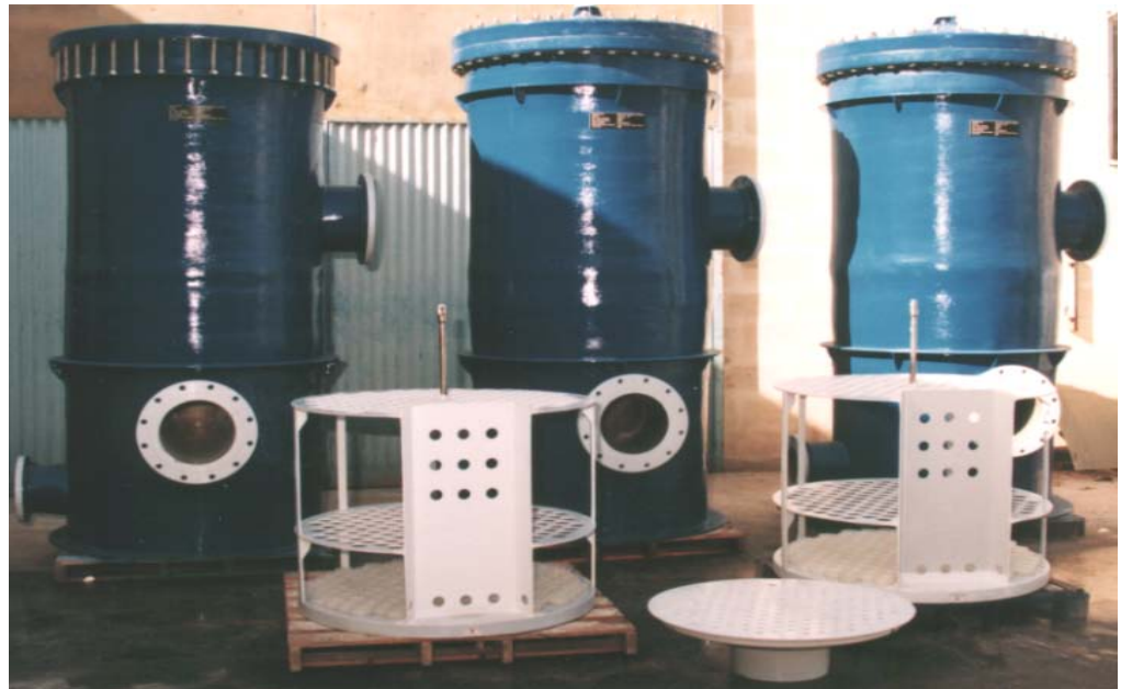
3 MODEL TPRO 140 VESSELS WITH BASKETS AND BOTTOM STRAINERS